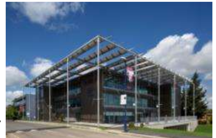
5G Innovation Centre building, University of Surrey

The 5GIC is a partner in vHive (see below).